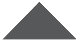
End caps (B)